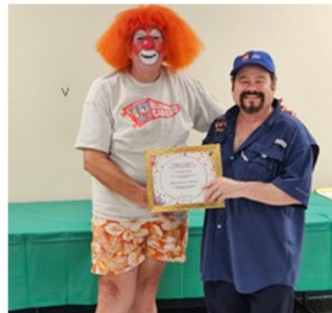
Zerbini Family Circus