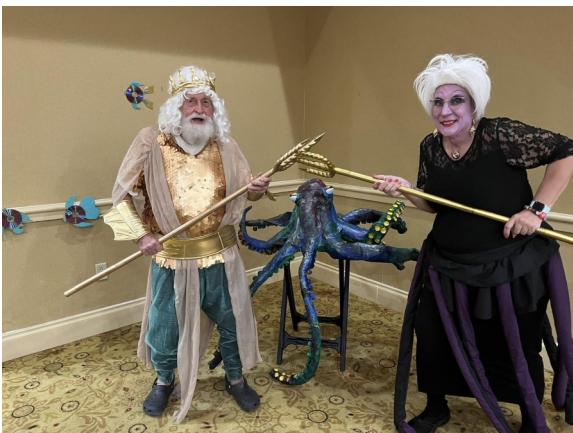
KingTitan and Ursula