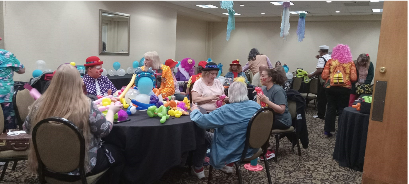
Hospitality Room gatherings with Balloon Jams