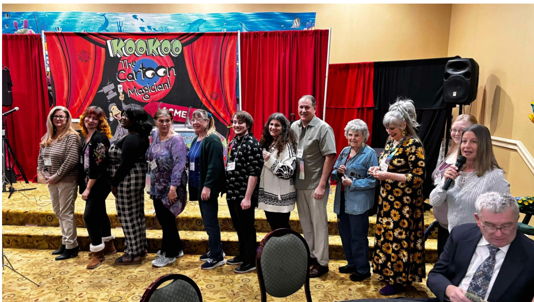
← Recognizing our first time attendees