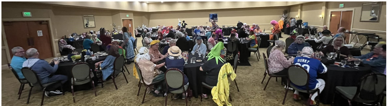
Lively Banquets with evening entertainment