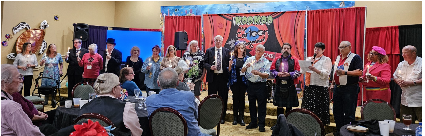
2025 MACA Officers and Directors