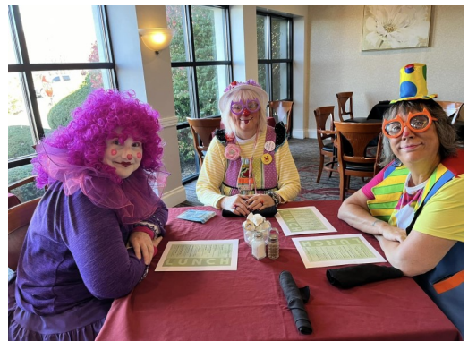
Dazzleberry Flossie and Tootle lu