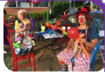
CLOWN WEEK AT THE CUP