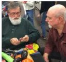
2108 Balloon Bash