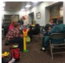
2108 Balloon Jam