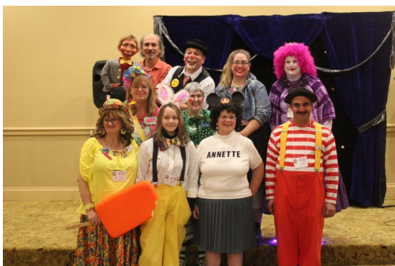
Open Skit Night