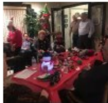
2018 Holiday Party