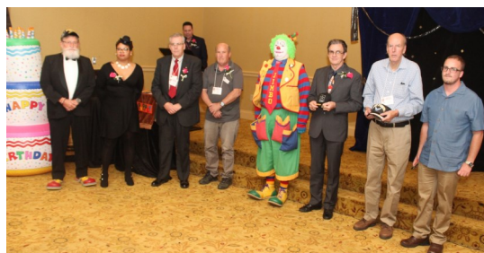
Honoring our Military Members and Veterans