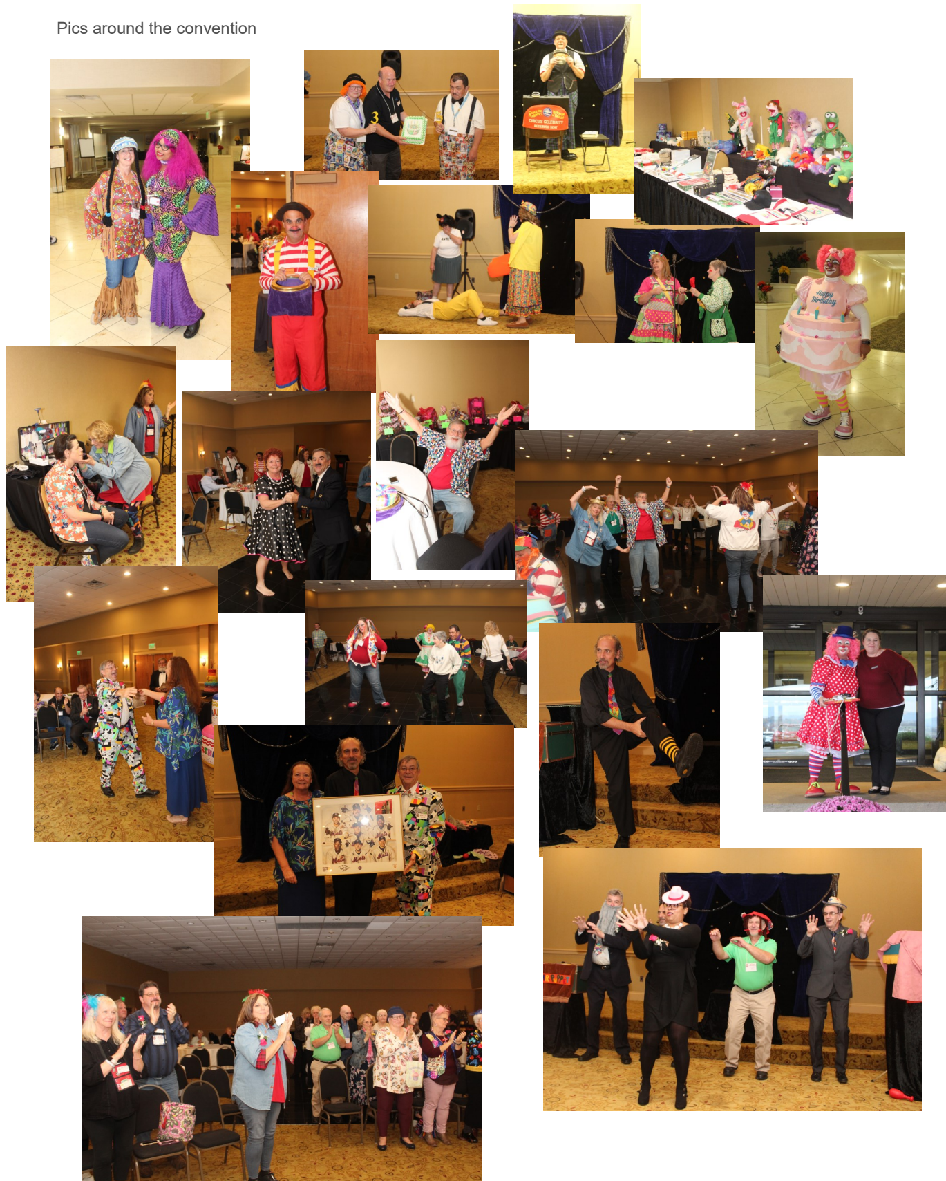
Pics around the convention