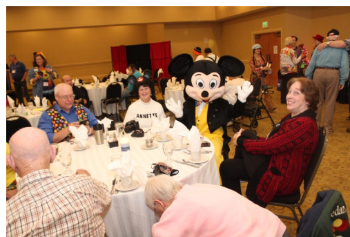
Themed dinner—Throw Back Thursday