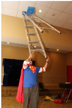
Installation Of Officers