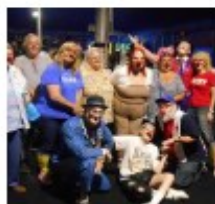
2018 visit to the Big Apple Circus