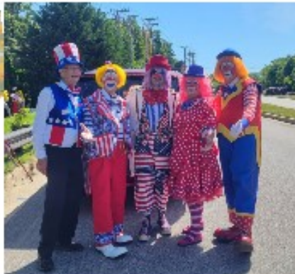
Walter L Main Memorial